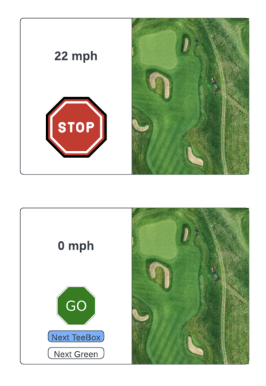
Figure 3: Potential UI design

The left section will always provide any relevant information about the cart's motion such as vehicle speed. Below this telemetry data will be a set of buttons that are shown depending on the state of the vehicle. If the vehicle is currently stopped, the user will be presented with a large "Go" button followed by two buttons that allow the user to choose where they would like to go. Once the user has selected either the "Next TeeBox" button or the "Next Green" button, they can press the "Go" button and the cart will switch states and begin transit. Once the golf cart is in transit, the user will be presented with a simple "Stop" button. Once pressed, this button will apply the brakes until the cart is back to the stop state. This simple system of stopping the cart will be necessary in case user input is needed to stop the cart. Similarly, if the user needs to apply corrective steering, they can do this directly through the steering wheel rather than interacting with the UI.